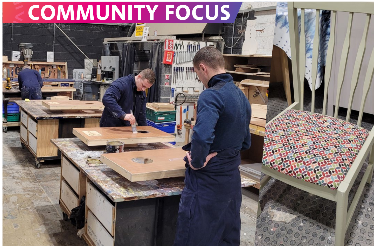
Good work: The Cairde Enterprises workshop in Limerick