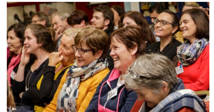
Social Enterprise Expo 2019

“They trained up people who wouldn't easily get work elsewhere, people who were ex-drug addicts, ex-offenders, people with disabilities, so there was a benefit there and because the labour is from the local community and the activity is based in the local community, there is economic gain for the area as well. You've got a triple benefit in that social economy project.”