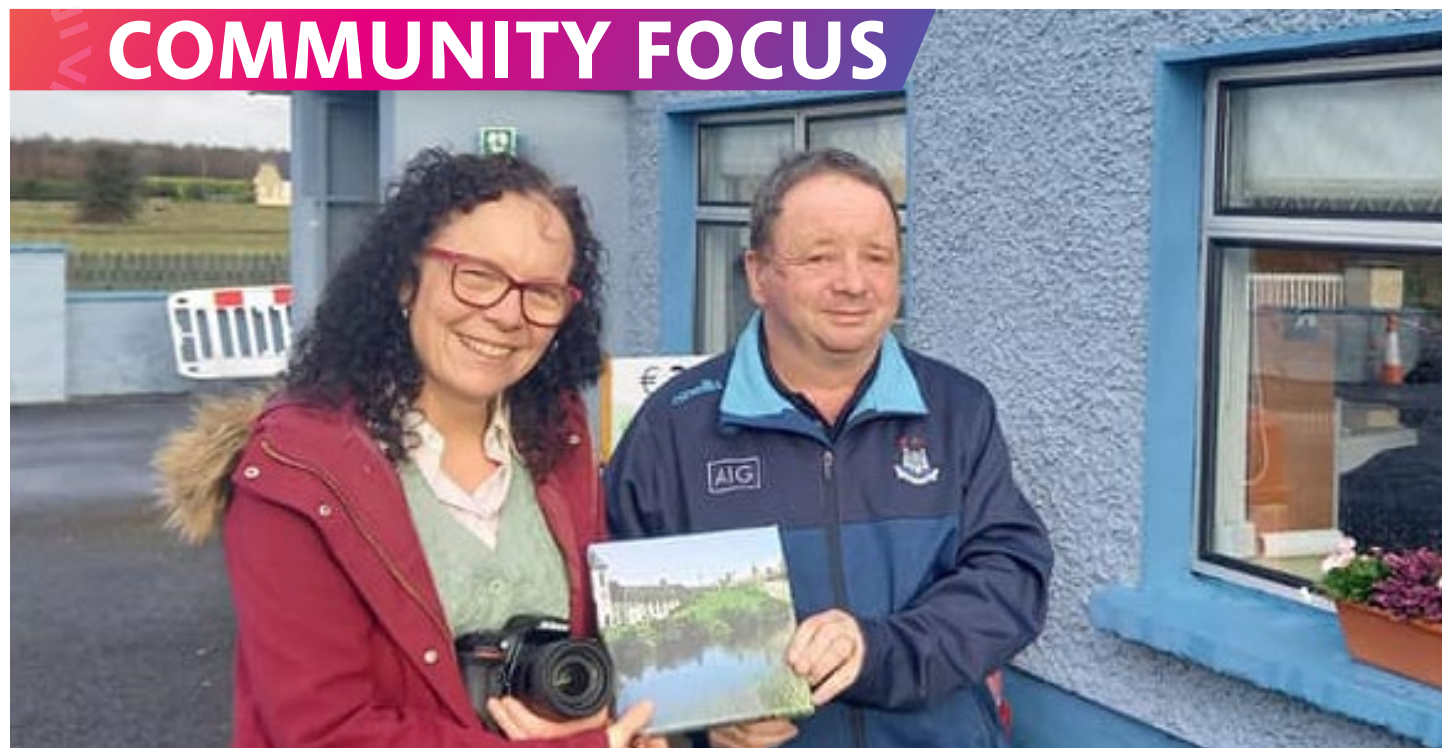
Good times: the Pullough shop has been bringing people